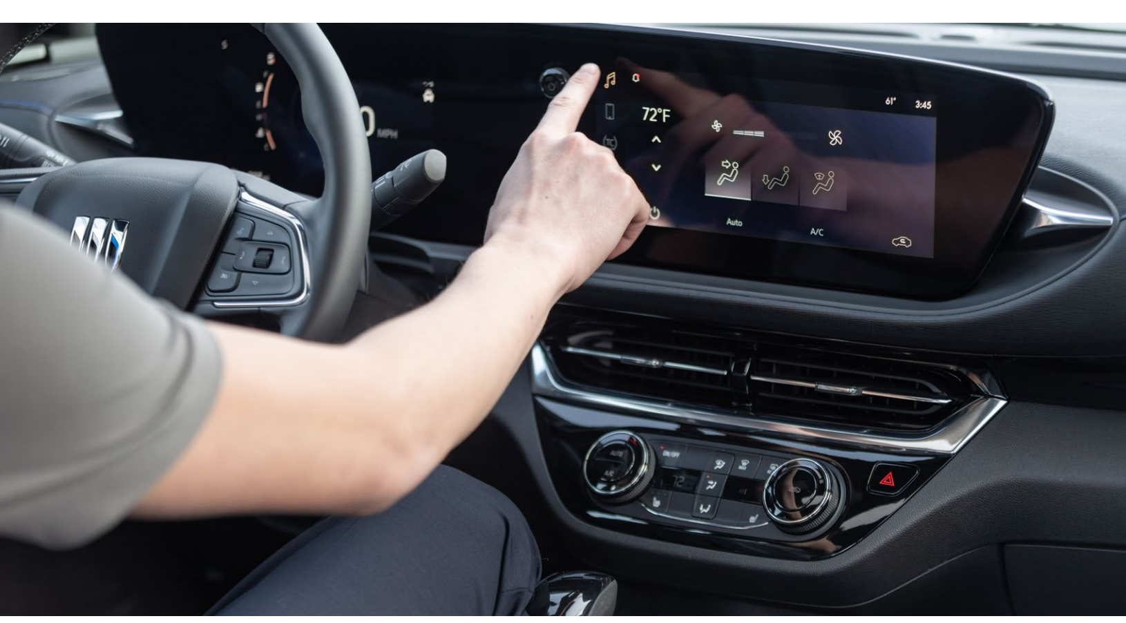
Sport Touring shown with available features.