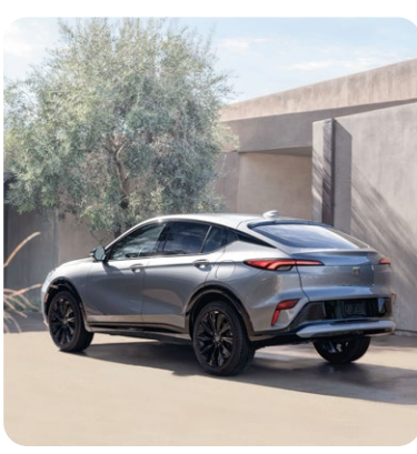
Sport Touring shown.