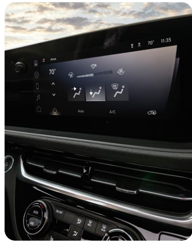
Sport Touring shown.