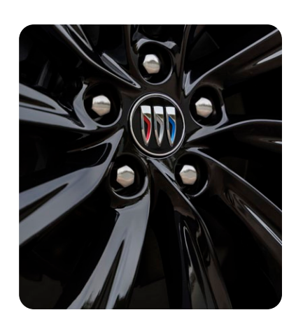
Sport Touring shown.