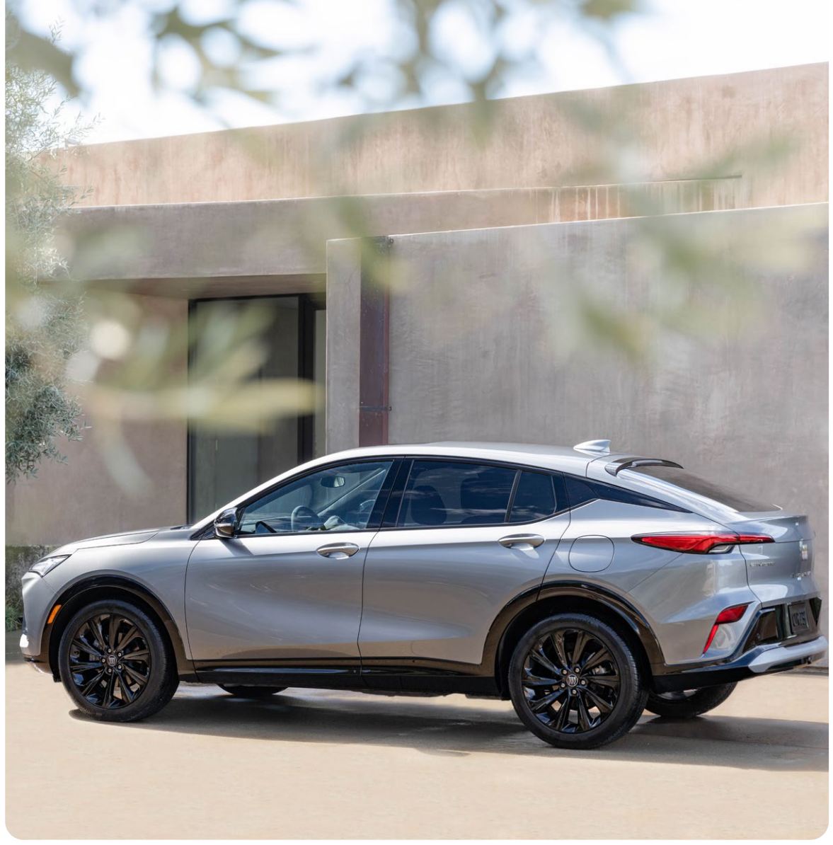
Available features shown.