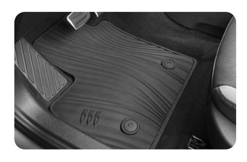
Premium all-weather floor mats Precision-engineered to fit Envision, these deeppatterned first-row mats offer stylish protection. High-friction backing helps prevent shifting, and the Buick Tri-Shield makes for a premium finish.