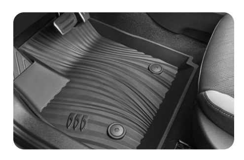
Premium all-weather floor liners Count on these custom first-row liners for superior fit and protection. Features include 3D design, Buick Tri-Shield, hassle-free installation and highfriction backing.