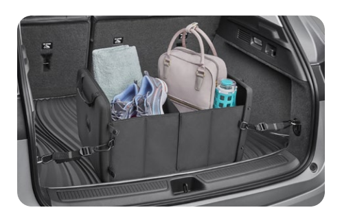
Cargo organizer The folding organizer is a versatile storage solution that includes dividers and attachment straps, which connect to the tie-down rings. This feature allows for customizable storage options. Additionally, the organizer adds a personalized touch with the Buick logo.