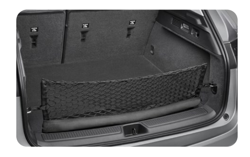
Vertical cargo net This envelope-style net secures items of various shapes and sizes and helps contain cargo when opening and closing the liftgate. The net conveniently stores in the integrated bag.