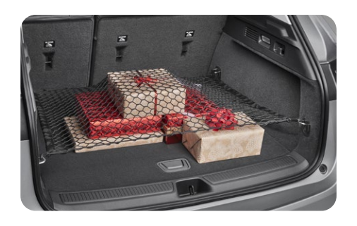
Horizontal cargo net Designed for Envision's cargo area, this durable netting helps prevent items from shifting while in transit. Its stretchable design adapts to various cargo shapes and sizes, helping keep items securely in place.