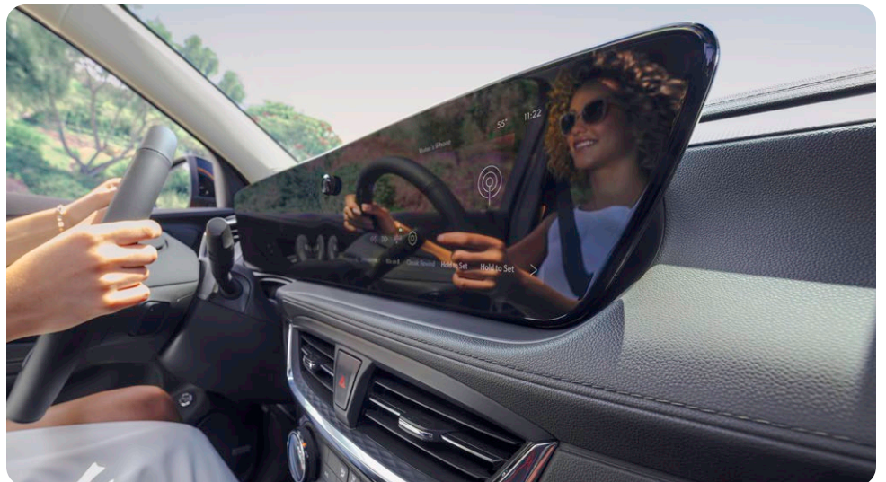
Sport Touring shown.