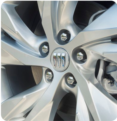
Preferred 18" wheel shown.