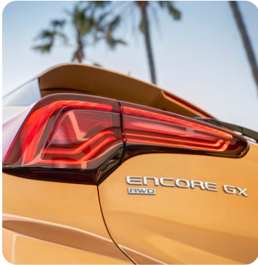
Sport Touring shown.

See your Buick dealer or buick.com for more feature details and requirements.