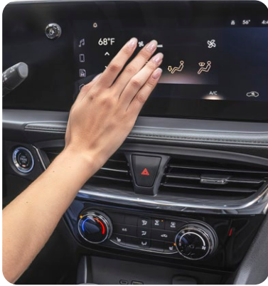
Sport Touring shown.