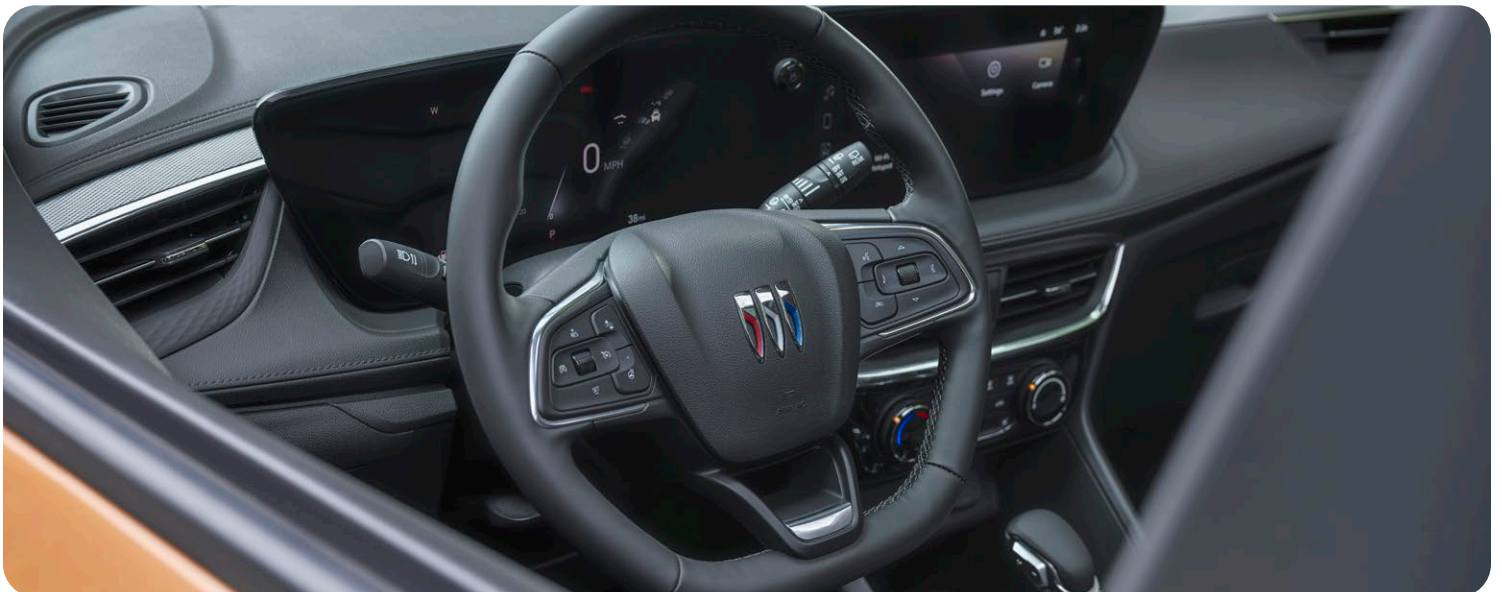
Sport Touring shown.

1 Safety or driver-assistance features are no substitute for the driver's responsibility to operate the vehicle in a safe manner. Read the vehicle Owner's Manual for important feature limitations and information. 2 Does not detect people or items. Always check rear seat before exiting. 3 Included and only available with Advanced Technology Package. 4 Included and only available with Avenir Technology Package.