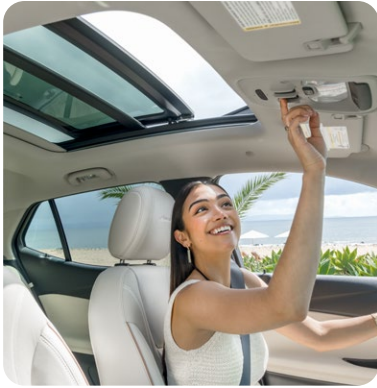
Avenir shown with available features.

See your Buick dealer or buick.com for more feature details and requirements.